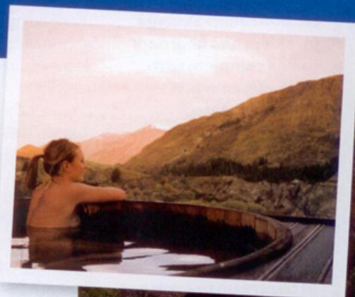
Main photograph: The stunning Lake Wakatipu near Queenstown. Above: Onsen Hot Pools.

Daily 11am–10pm; free shuttle from Queenstown (10 mins drive); 160 Arthurs Point Road; 03 442 5707; www.onsen.co.nz .